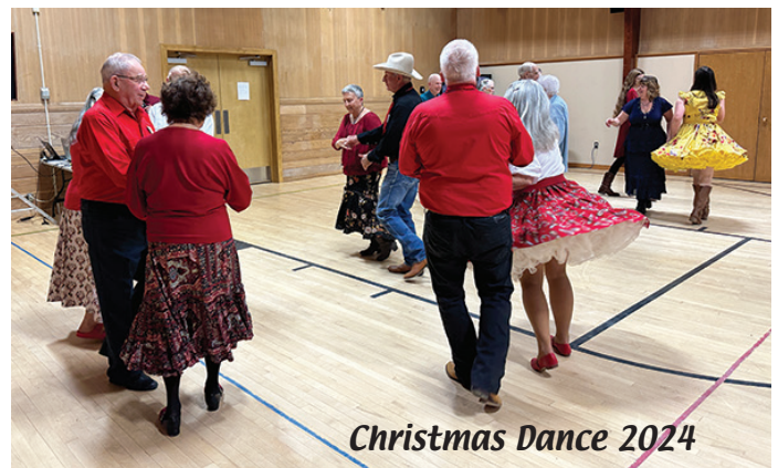
Christmas Dance 2024